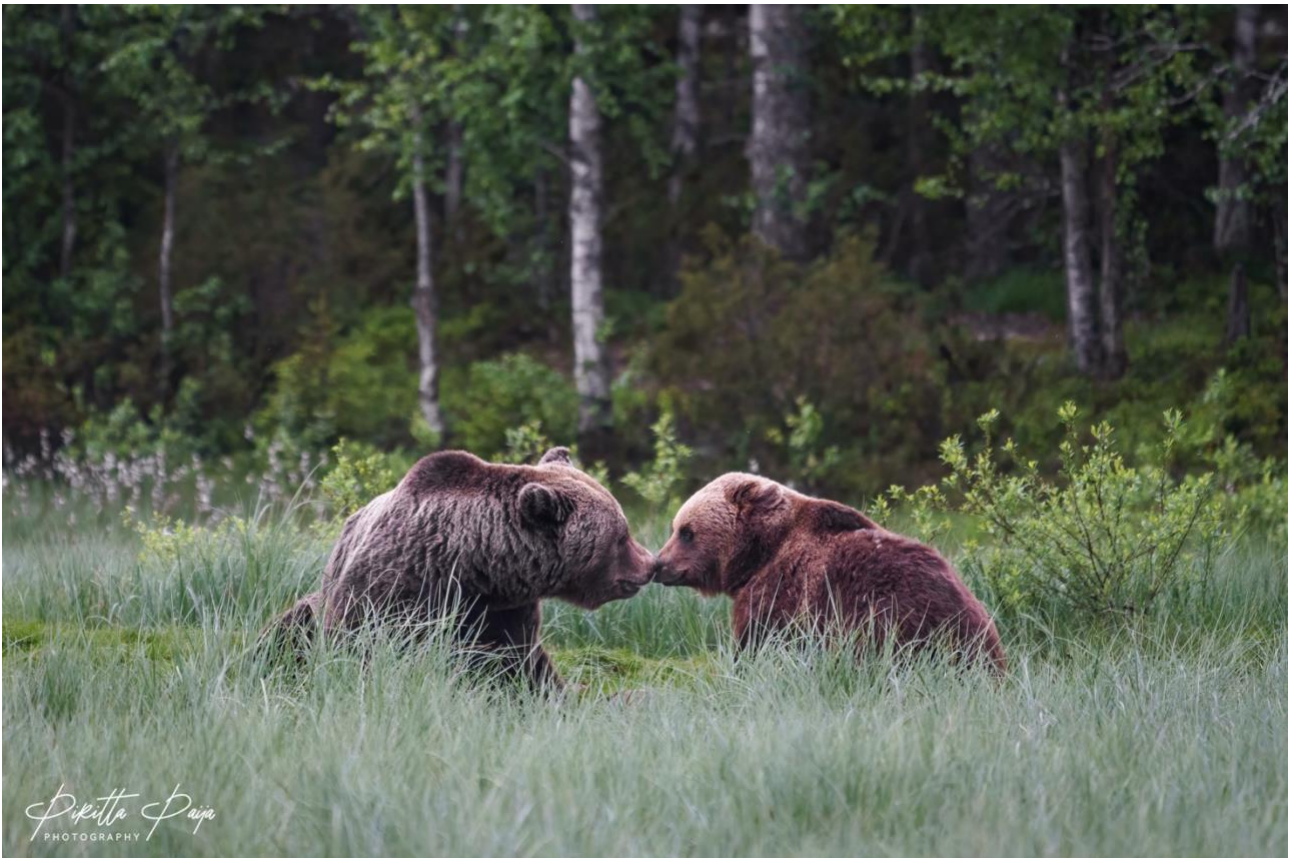
A male and female brown bear ( Ursus Arctos ) meet in a taiga forest during the mating season in June, 2023, northern Finland.

As you navigate the emotional landscape of wildlife photography, remember that the power of your images lies not just in technical finesse but in the emotional connection forged between the photographer and the untamed subjects of the wild.