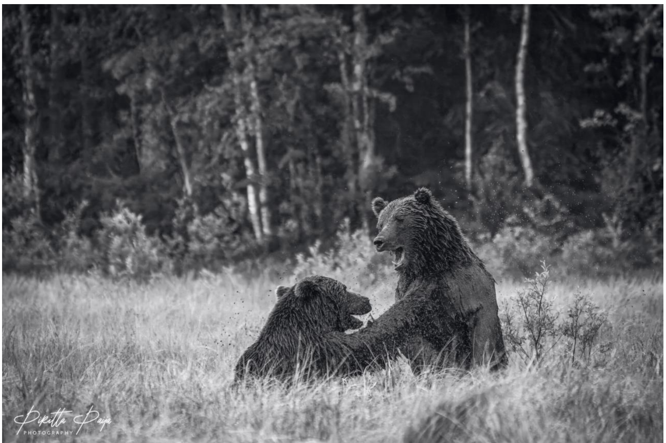
Two brown bears ( Ursus Arctos ) having a short fight in the swamp in northern Finland.

Embrace this transformative journey — from mechanical to mindful photography — where your lens becomes a conduit to the soul of wildlife, capturing stories rather than just images.