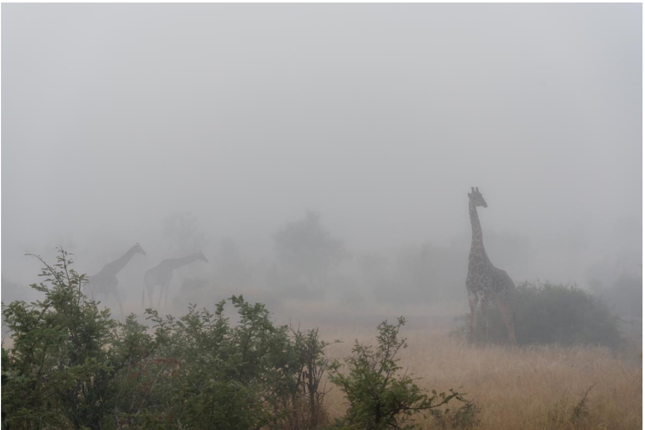
Giraffes on a misty morning in Kruger National Park, South Africa.

As you step into your next photography session, remember that it's not just about what you see; it's about being fully present in the untamed complexity of nature with all your senses and your soul. It's a physical, mental, and spiritual connection.